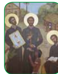
Sts. Roch Gonzalez, Alphonsus Rodriguez & John del Castillo, Martyrs