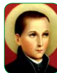
St. John Berchmans