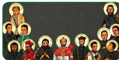
All Saints & Blessed of the Society