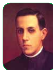
Bl. Michael Pro