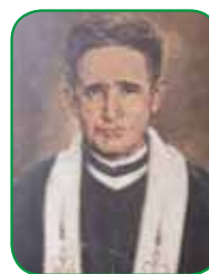
Bl. Rupert Mayer