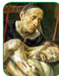
St. Joseph Pignatelli