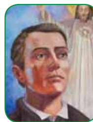
Bl. Bernard de Hoyos