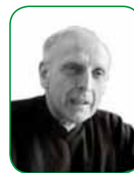
Servant of God, Pedro Arrupe's birth anniversary