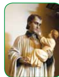
St. Stanislaus Kostka